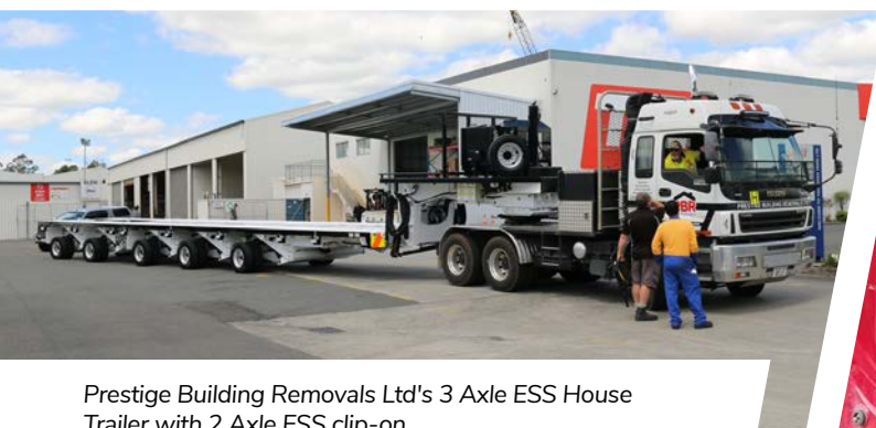
Prestige Building Removals Ltd's 3 Axle ESS House Trailer with 2 Axle ESS clip-on.