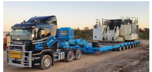
Max Cranes Modular Platform Trailer 8x8 with Dolly & Lattice Boom Extension.