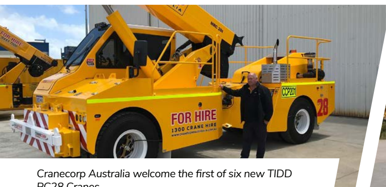
Cranecorp Australia welcome the first of six new TIDD PC28 Cranes.