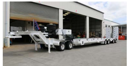
T&C Excavations (AU) Axle Widening Quad with Folding Ramps.

2021 is shaping up to be a great response to the challenges of 2020. TRT has seen increases in orders and activity. This is especially noticeable from NZ operators who are choosing to invest in quality trailers and equipment, with increasing confidence in the market. Even more important, they are choosing to buy local, with 100% local ownership.