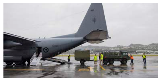
TRT designed General Service Trailer for NZ Defence used in deployment applications.

Cover Photo: Richmond Heavy Haulage 4x8 Low Loader, 2020.