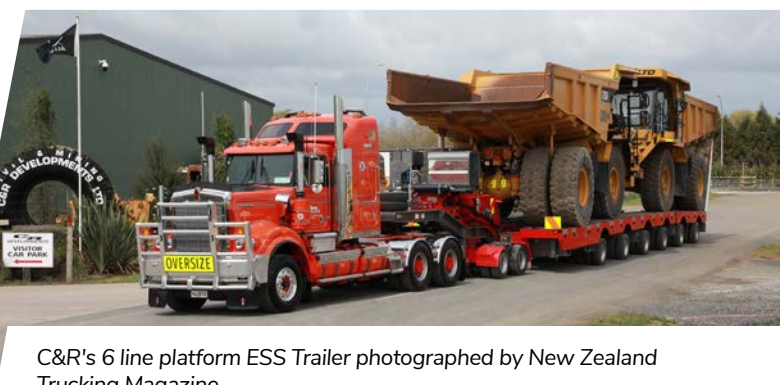
C&R's 6 line platform ESS Trailer