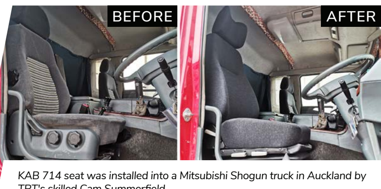
KAB 714 seat was installed into a Mitsubishi Shogun truck in Auckland by TRT's skilled Cam Summerfield.