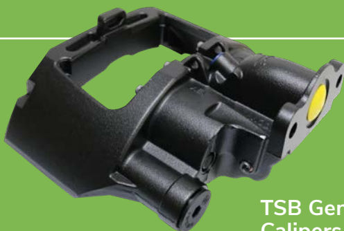
TSB Genuine Calipers

Check out our range of genuine TSB calipers and pads!