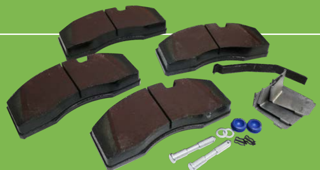
TSB Genuine Pads