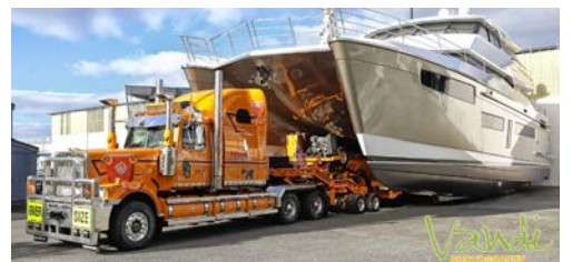
Pollock Cranes move 26m, 89t Superyacht using ESS modular platform 6x8+2x8 + dolly in June.